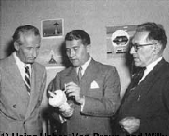
1) Heinz Haber, Von Braun, and Willy Ley look at one of the props from "Man in Space."

Thursday, 06 August 2009 18:38 - Last Updated Thursday, 31 March 2011 18:48