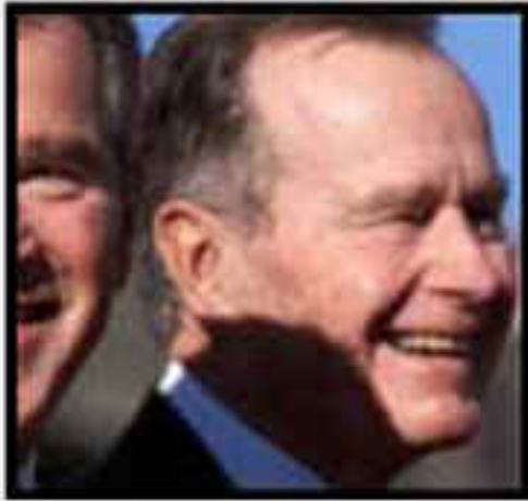
George H. W. Bush former President

Former CIA Director Rumored Visitor to Area 51 Carlyle Group Board Member