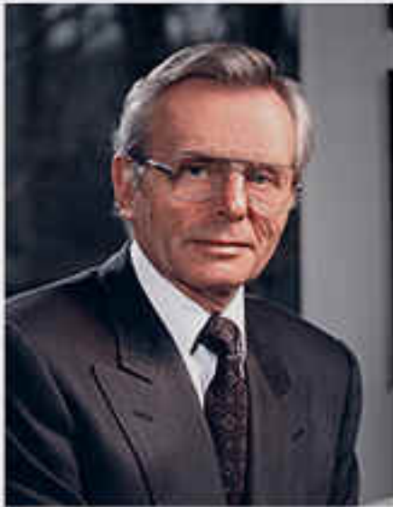
Frank Carlucci Military Businessman

Procurer of new weapons (81-83) Reagan Nat'l Security Advisor Secretary of Defense Member/Chair Carlyle Group Board of many Think Tanks