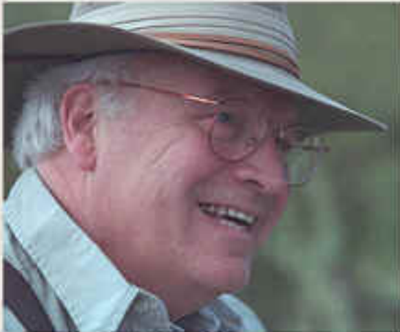
Dick Cheney Vice President

Former Congressman Former Chief of Staff - Ford Former Sec. of Defense- Bush Vice President